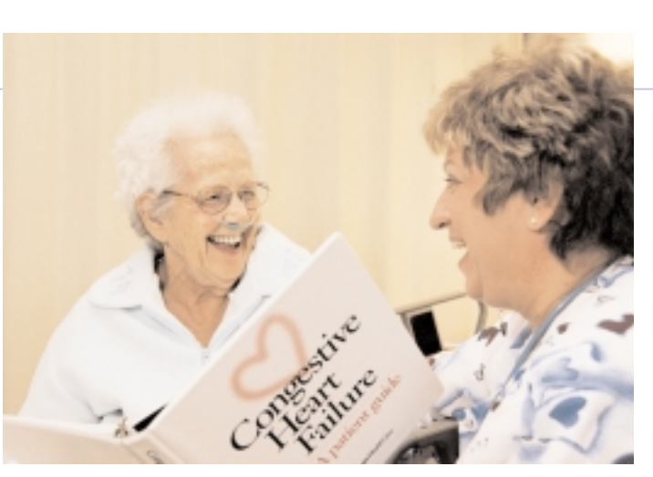
By sharing best practices and standardizing their educational materials, Advocate South Suburban Hospital and the seven other hospitals taught congestive heart failure patients to manage their illness more effectively than ever before.

Each year, thousands of people survive diseases that were once nearly always fatal. Medical research and the development of new technologies continuously expand the tools and techniques at caregivers' disposal. By helping Advocate stay at the forefront of innovation, our donors ensure that our patients receive the latest and best in care.