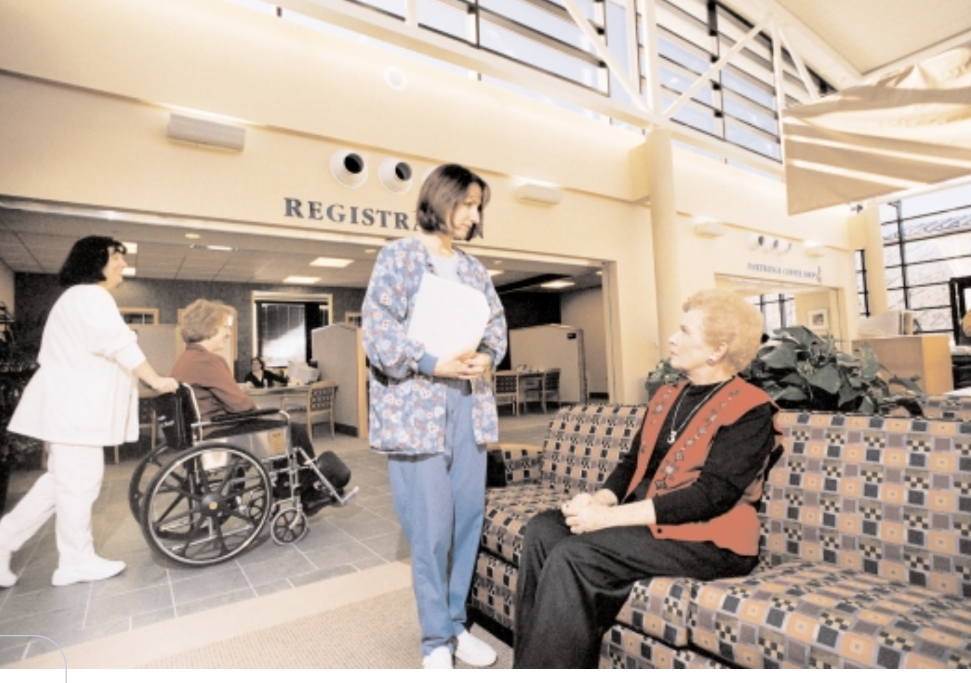
The new 26,000-square-foot outpatient pavilion at Advocate Good Shepherd responds to projected growth trends for the Barrington area and the needs of an aging population by centralizing all outpatient services in one wing of the hospital.