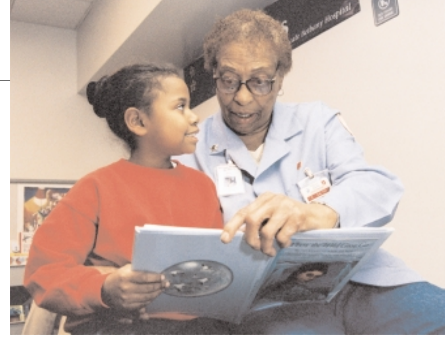
Anxiety and stress are daily realities for sick children, their siblings and families. Advocate Bethany Hospital's Reach Out and Read Program provides age-appropriate books to children, caring for the whole person by encouraging both healthy family interaction and literacy.

It takes more than medical care to restore and sustain health. Driven by values grounded in faith, Advocate's commitment to treat the whole person mind, body and spirit — takes many forms: parish nurses who care for entire church congregations, pastors who train for service in health care settings, caregivers who simply take the extra moment to minister to the human, spiritual needs of our patients. Our donors provide essential funds to ensure this work continues.