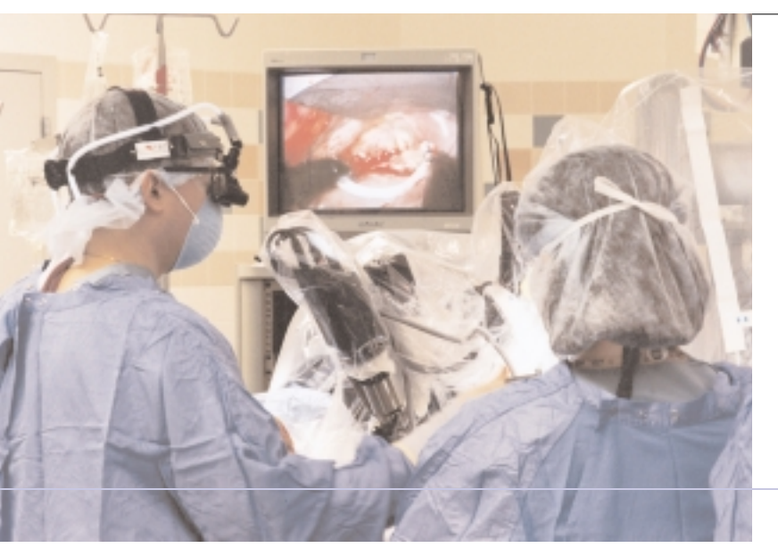
Christ Medical Center is one of only six sites nationwide testing the merits of minimally invasive, endoscopic surgery with the da Vinci robotic surgical system, an innovation promising patients quicker recovery and less chance of tissue and nerve damage or infection.